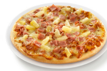
Bull Pen Pizza